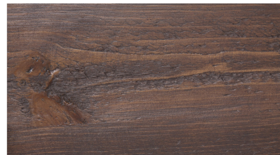
Weathered Grey Finish