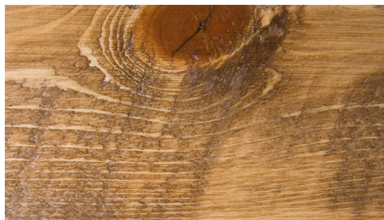
Honey Pine Finish

This rustic barnwood poker table will be a wonderful addition to your game room. This barn wood poker table is built as a multi-purpose table with one side being the card table and one side being the dining table. Each rustic poker table top has eight cup holders, with cork inserts, and chip trays routed out. The table top is two-inch thick and is built out of Ponderosa pine but stained to match the barnwood furniture. The poker table top is stocked with charcoal felt to match the one-inch clevis nails, but you can select your choice of felt to match any other game table or decor in your home as well. When you are not playing cards, just flip this table top over and you will have a smooth dining table.