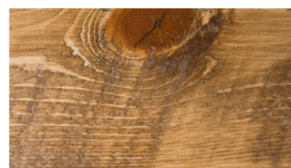
Honey Pine Finish