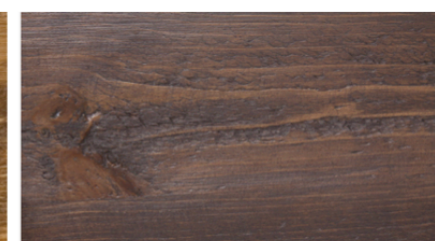
Weathered Grey Finish