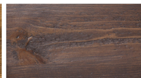
Weathered Grey Finish