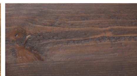
Weathered Grey Finish