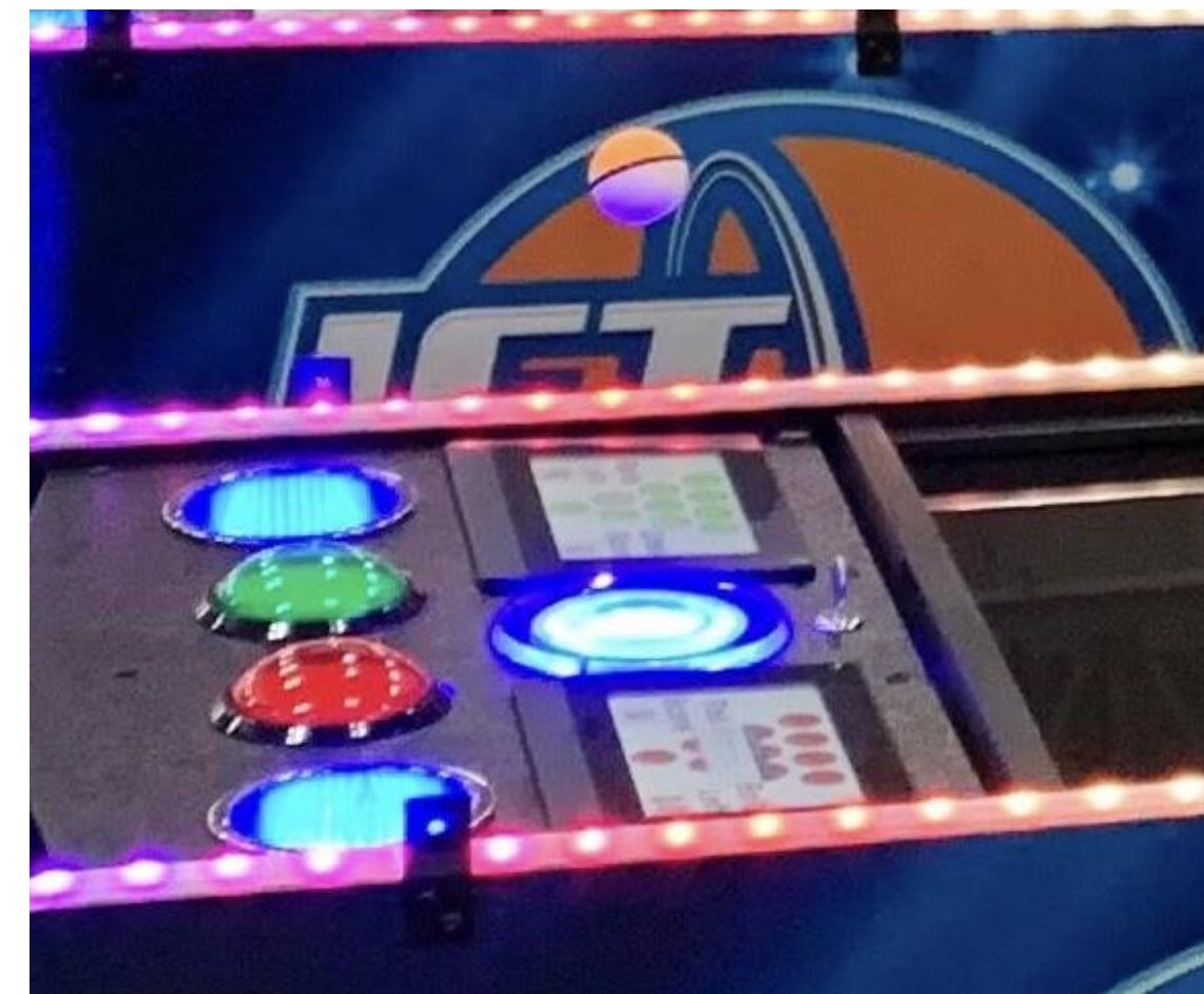
Floating in air, the ping pong ball waits to be grabbed by the player. The game features all sorts of cool touches including glowing cups according to player color (red or green) and two displays that show scoring, diagnostics and advertising.